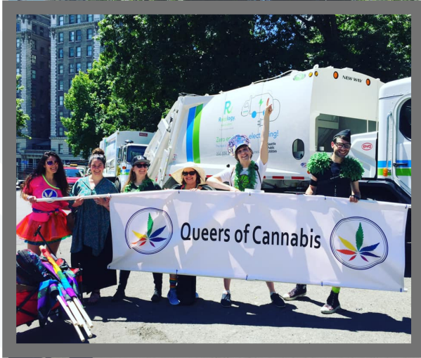
Seattle Pride Parade, 2019

At first, we were known as The Queers of Cannabis.